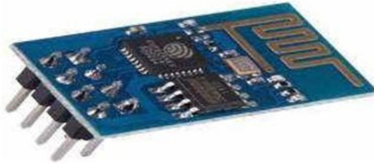
Fig. 4. ESP8266 Wi-Fi module

There are various ways in which the Arduino microcontroller can be connected with the internet. First way is by using the Arduino UNO Wi-Fi board. It is a microcontroller board with Wi-Fi module embedded in it. Second way is to use a separate ESP8266 Wi-Fi module. It has integrated TCP/IP protocol stack. It has 1MB Flash memory. It is IEEE 802.11 b/g/n Wi-Fi. It has 16 GPOI pins. It supports SPI as well as I2C communication protocols. Predefined library is also available for coding. The fig below shows a ESP8266 Wi-Fi module. The hardware connections required to connect to the ESP8266 module are fairly straight-forward but there are a couple of important items to note related to power.