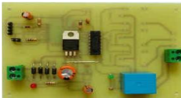
fig. 5. Hardware implemented till date