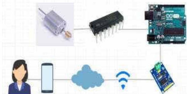
Fig. 2. Schematics representation of proposed technique

The above figure shows the basic block diagram of the proposed technique and the below circuit diagram shows the man can operate various factory machineries just by a clicking his Smartphone application.